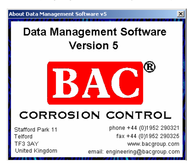
For a FREE 30 day trial copy of the software call or email us.

Being MS Windows<sup>®</sup> based the software will print directly to any suitable printer (colour or black and white) negating the need for costly dedicated plotters.